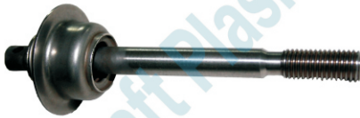
LONGITUDINAL WELD OF SS