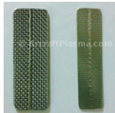
SS316 SINTERED MEDIA