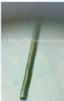
CATHETER TUBE WELD