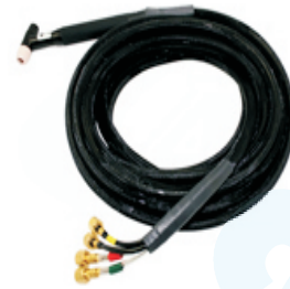
MICRO PLASMA TORCH WITH CABLE